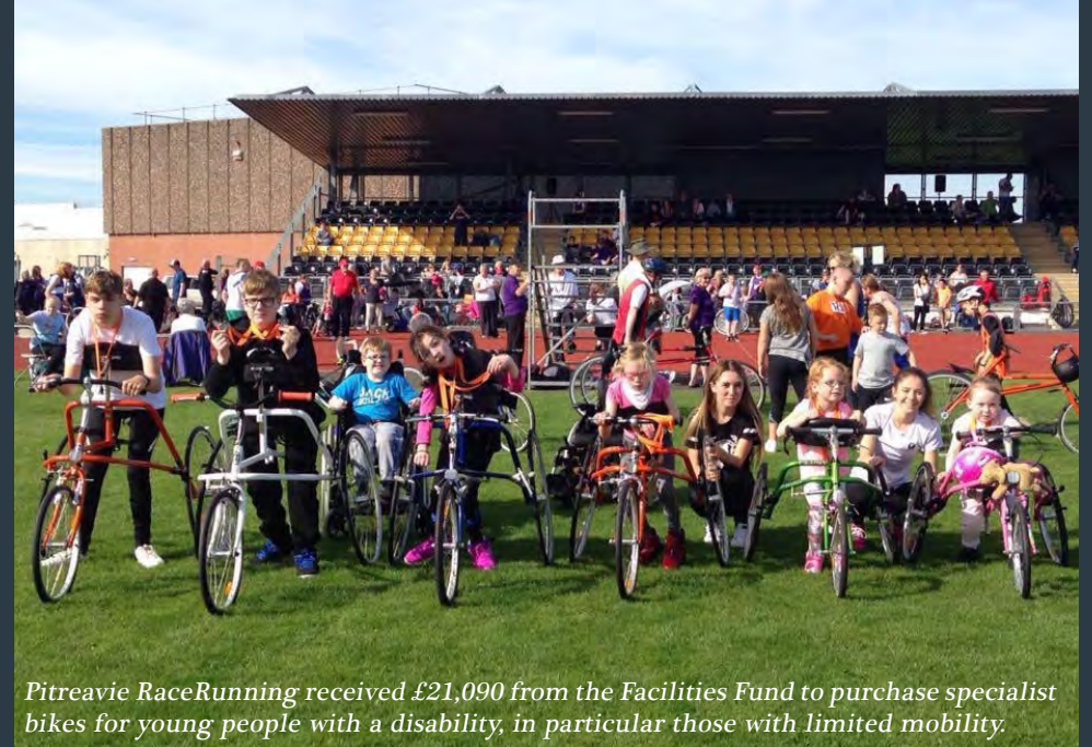
Pitreavie RaceRunning received £21,090 from the Facilities Fund to purchase specialist bikes for young people with a disability, in particular those with limited mobility.

Youth Work: CashBack has supported youth work projects since 2008 and sees this area as critical. Projects supported young people to become successful learners, confident individuals, effective contributors and responsible citizens.